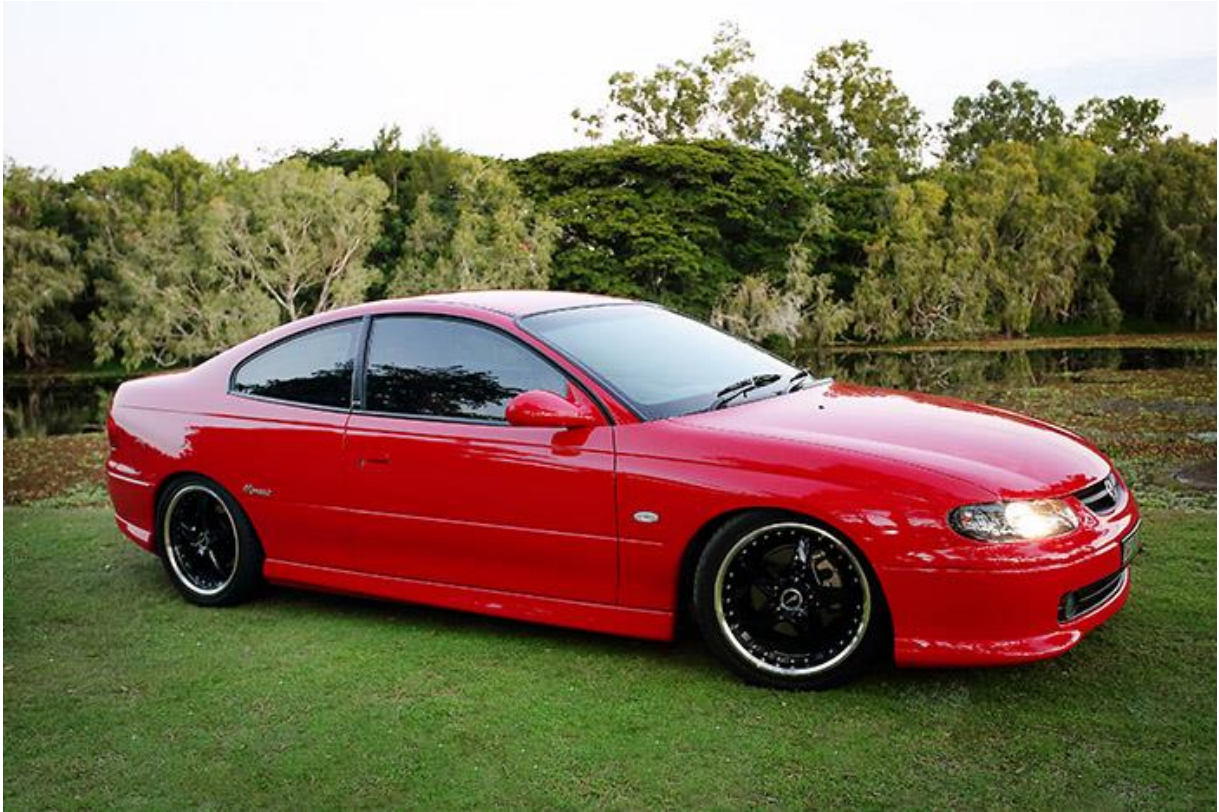
Holden Monaro Coupe