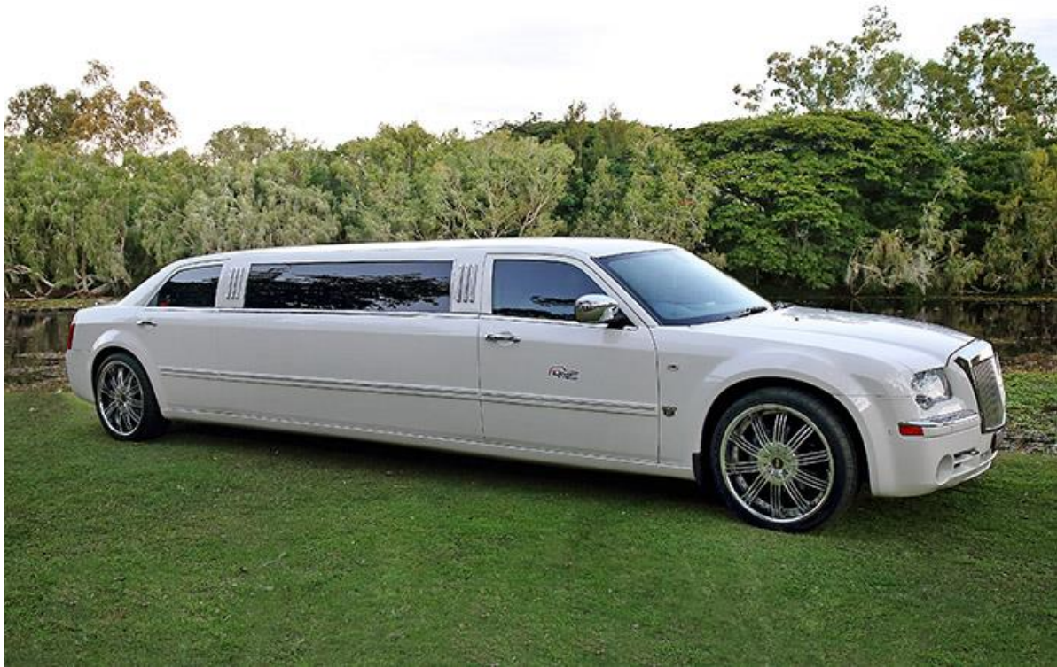
Chrysler 300c Stretch Limousine