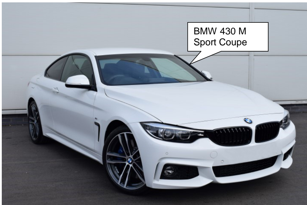
BMW 430 M Sport Coupe