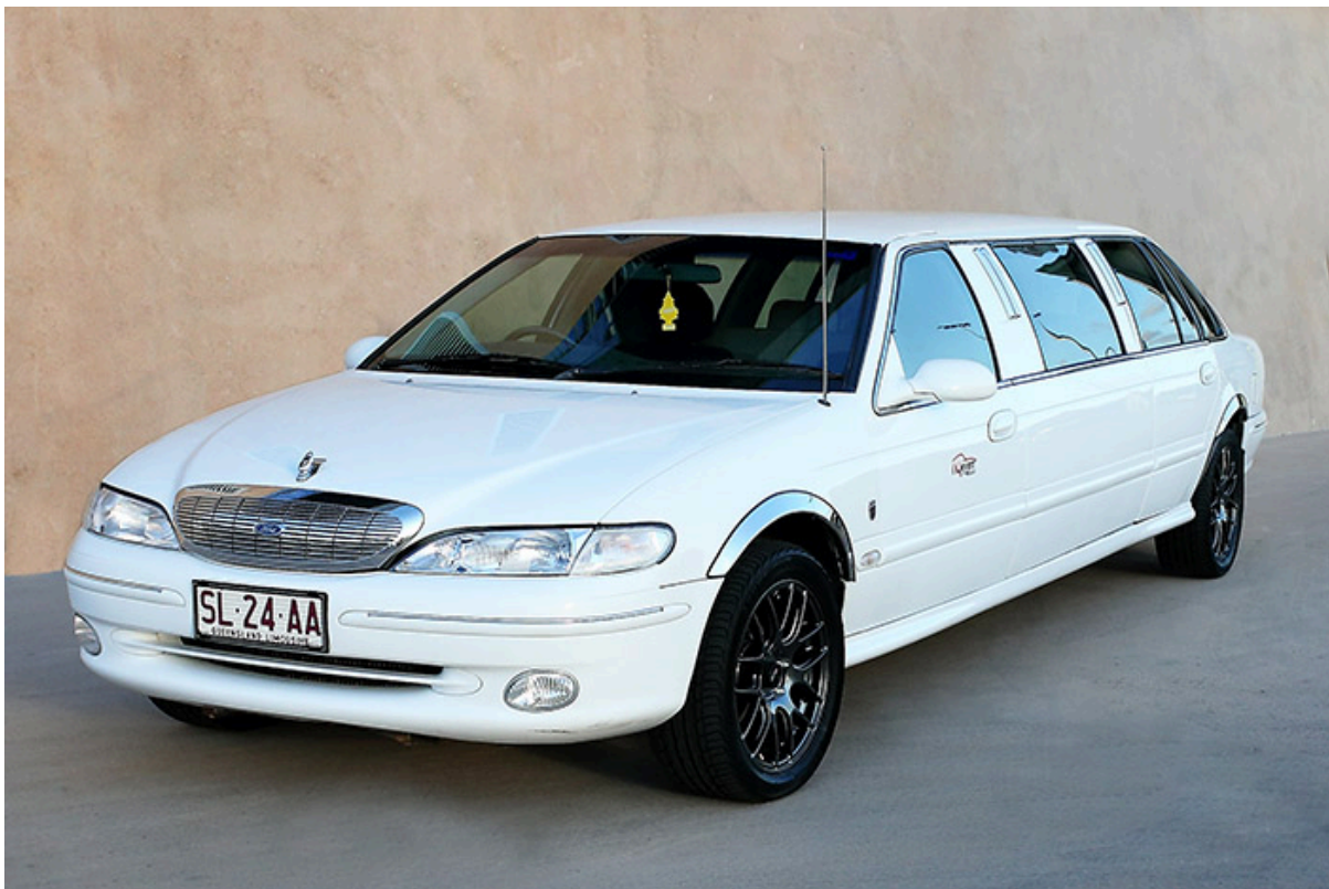
Ford Fairlane Ghia Stretch Limousine