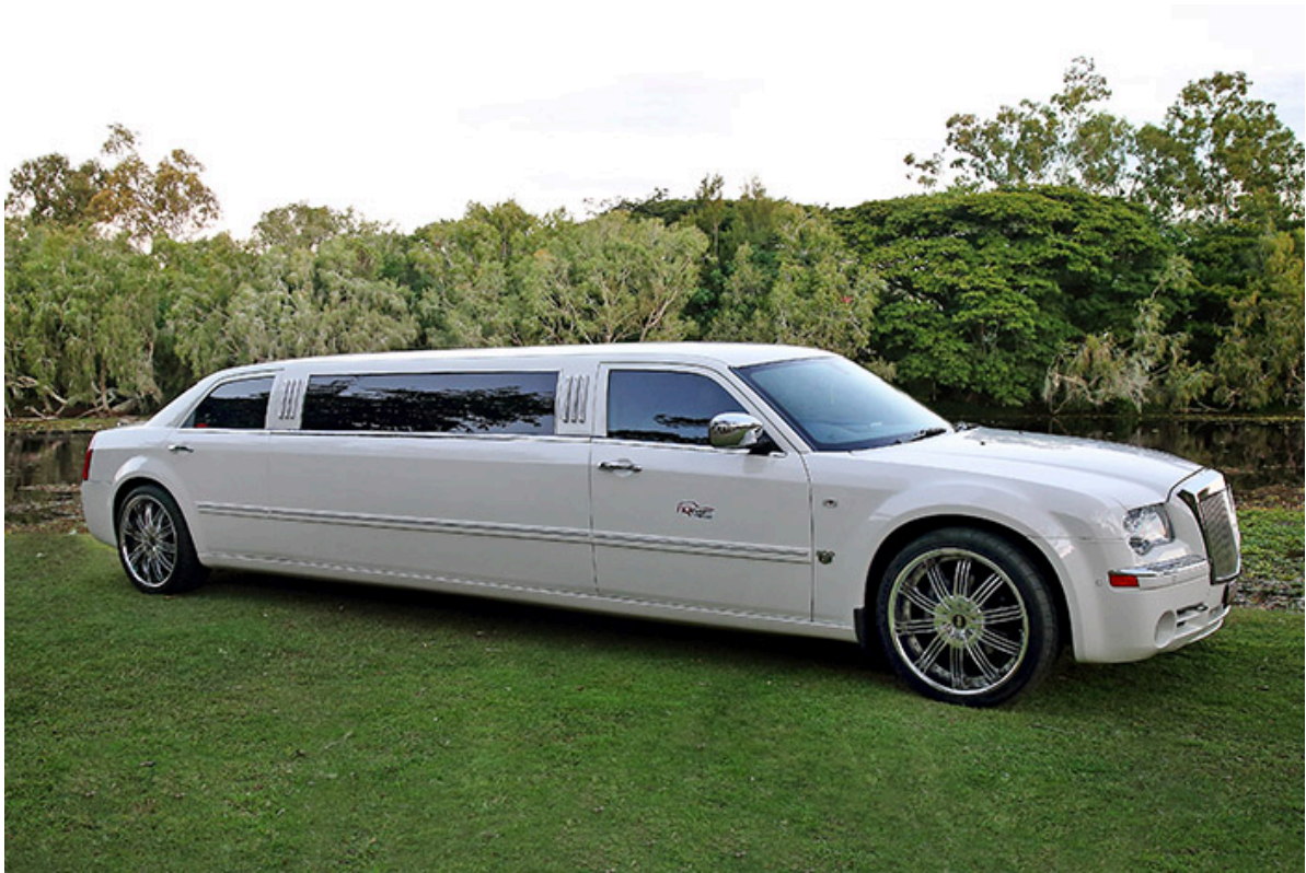
Chrysler 300c Stretch Limousine