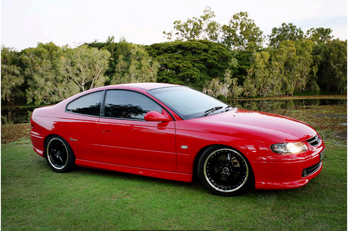
Holden Monaro Coupe