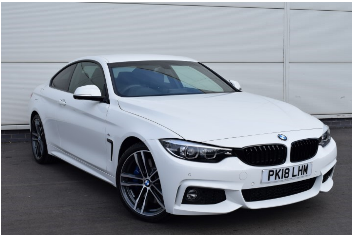
BMW 430i M Sport Coupe