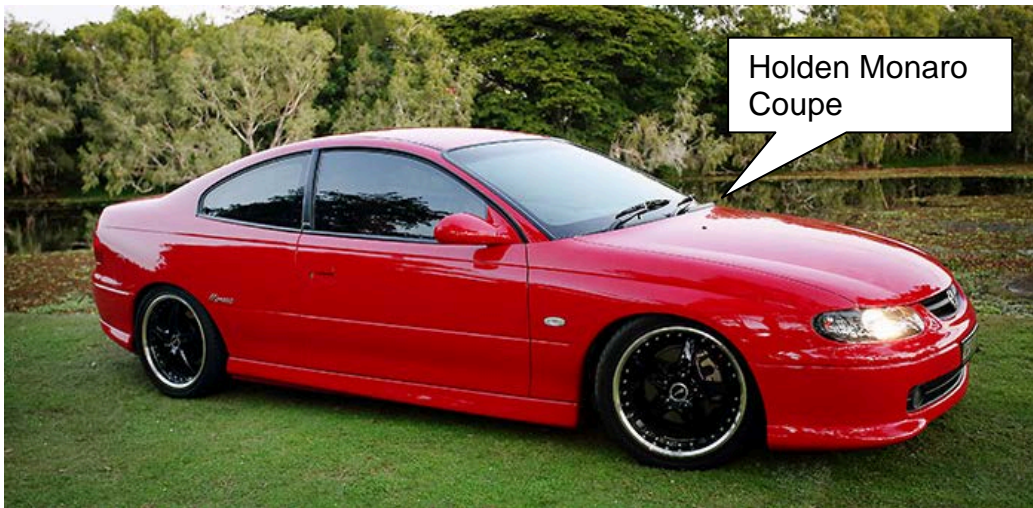
Holden Monaro Coupe