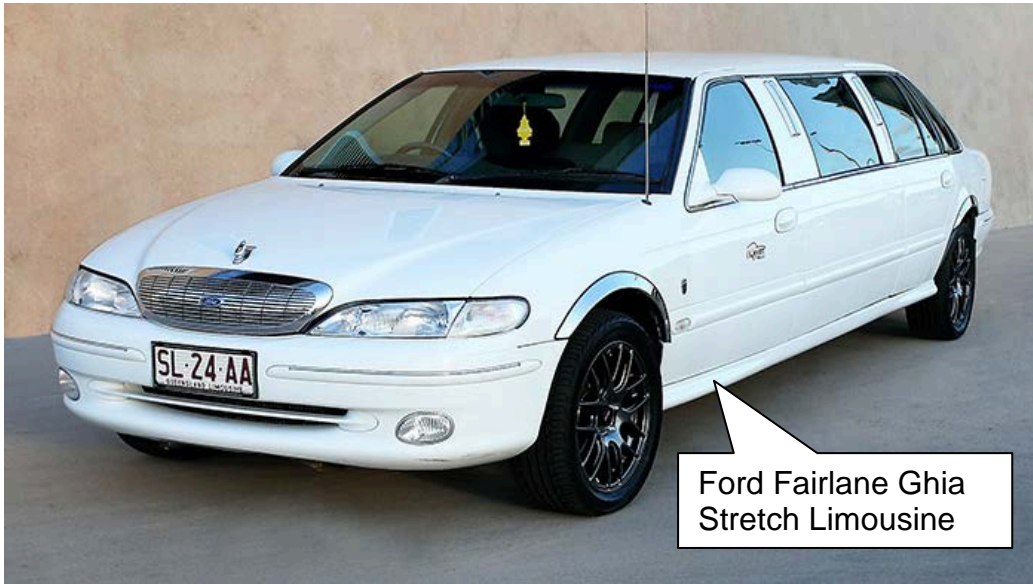
Ford Fairlane Ghia Stretch Limousine