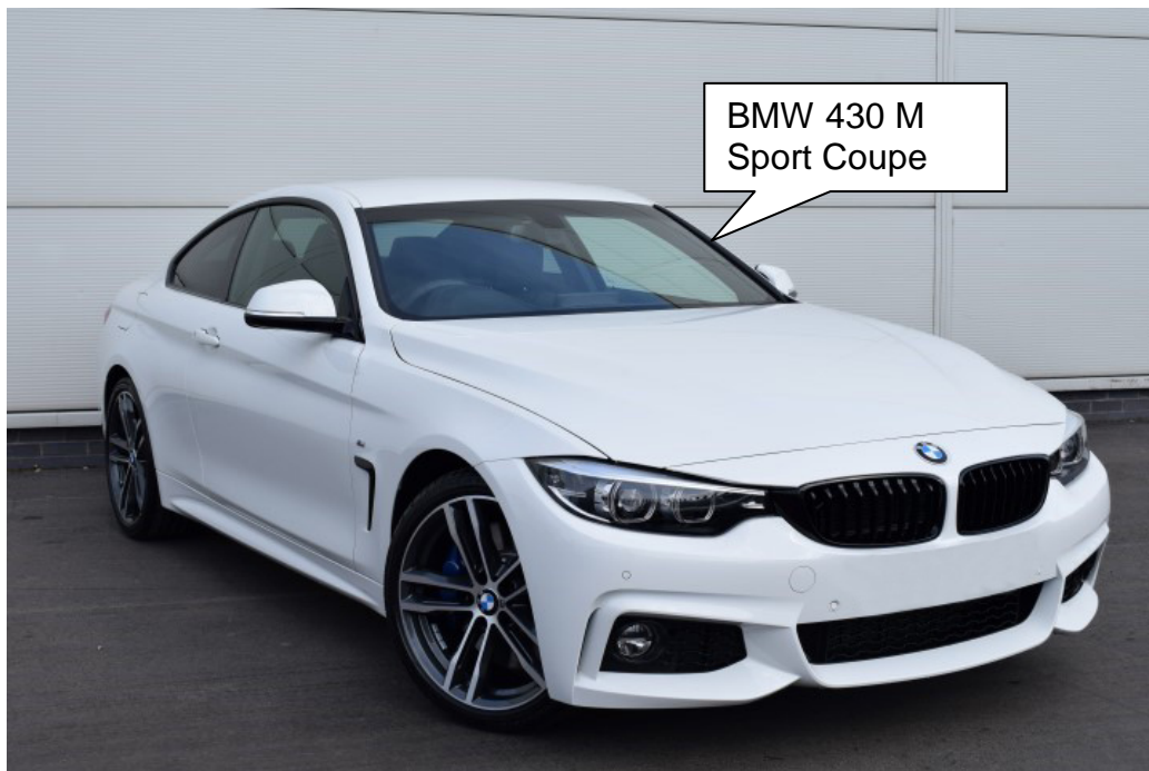
BMW 430 M Sport Coupe