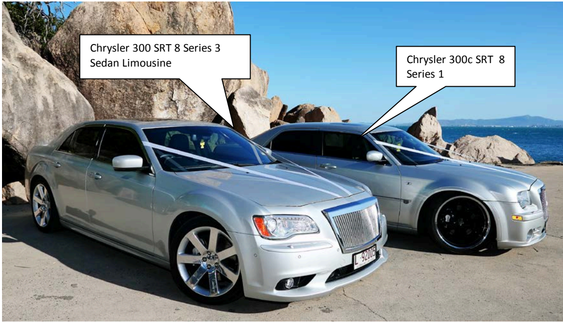
Chrysler 300 SRT 8 Series 3 Sedan Limousine