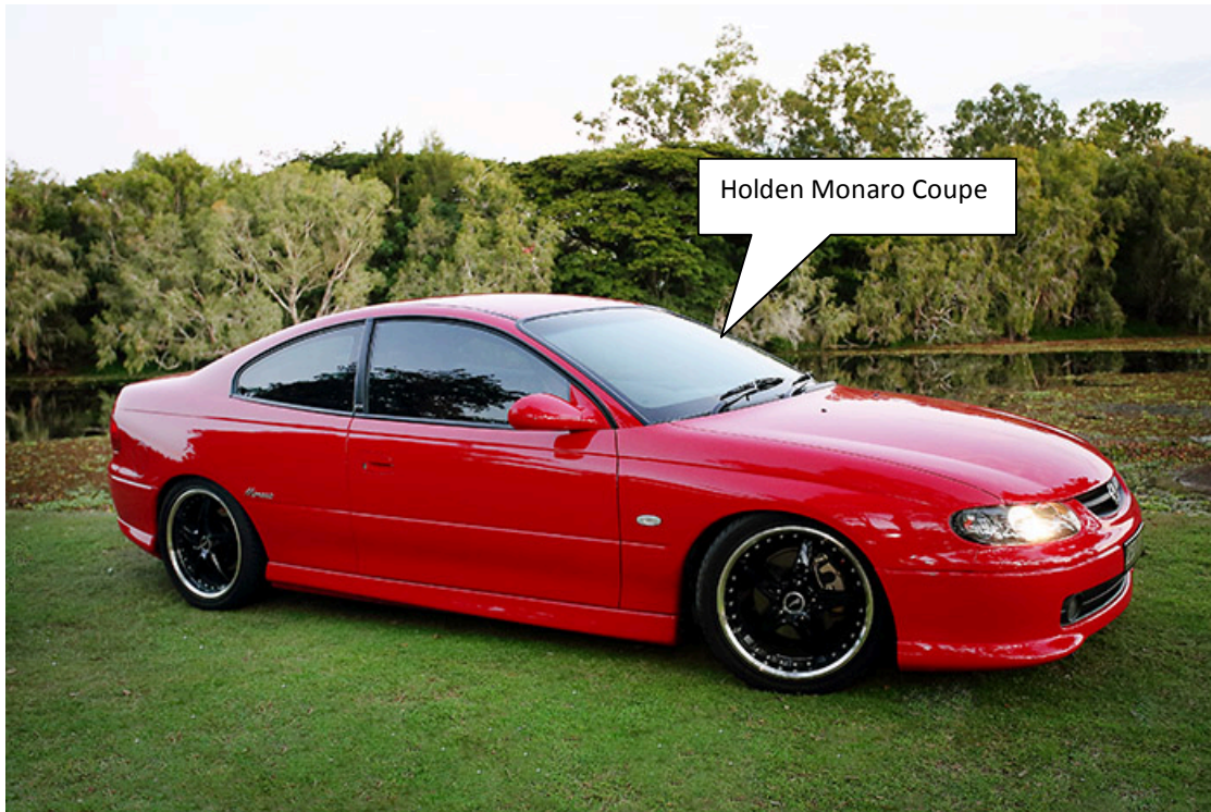
Holden Monaro Coupe