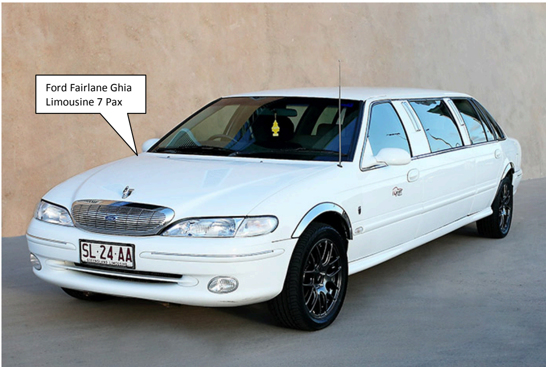
Ford Fairlane Ghia Limousine 7 Pax